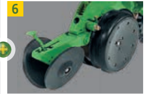
Cast-iron Closing Wheel